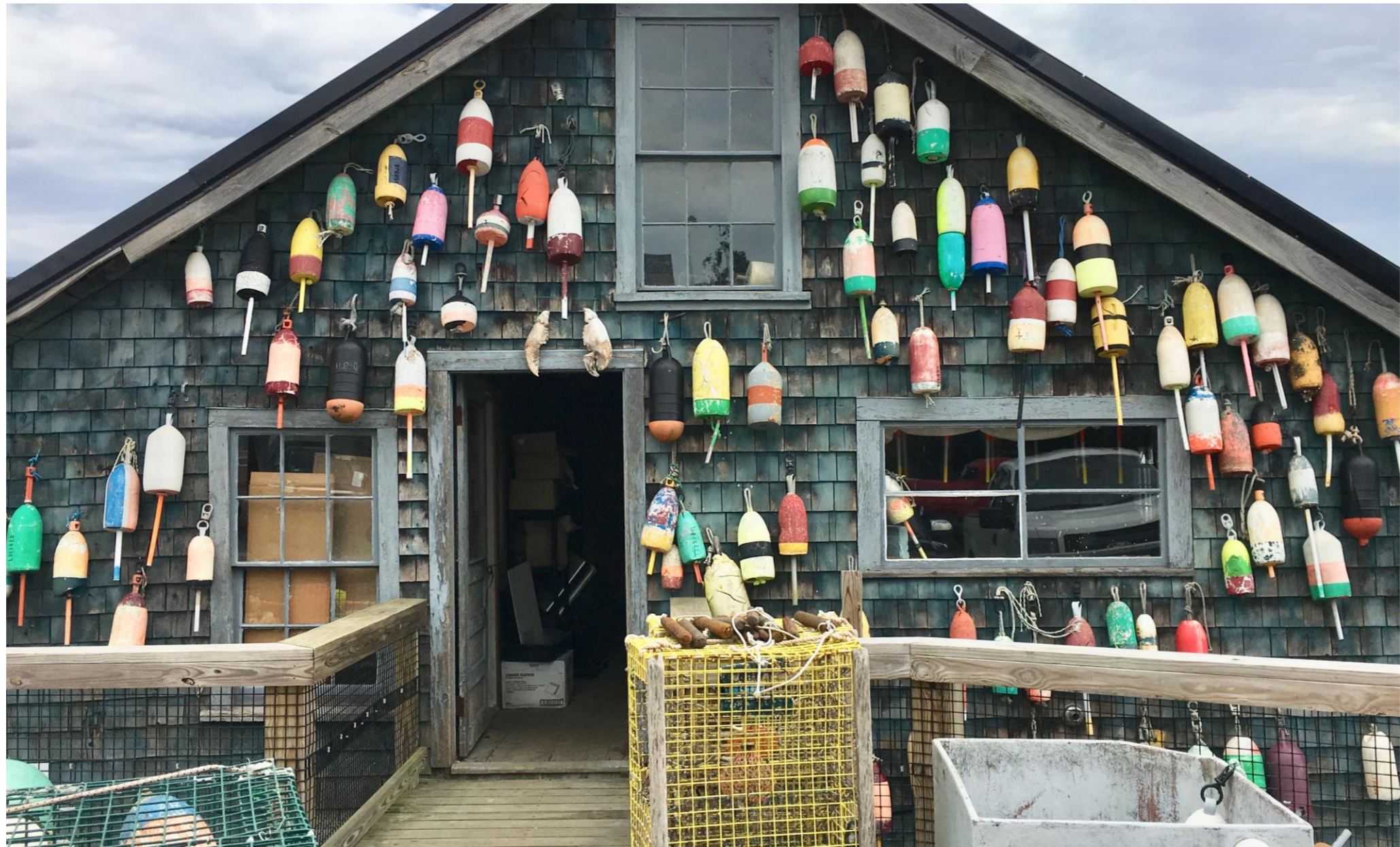
Lobster Shack Original Image