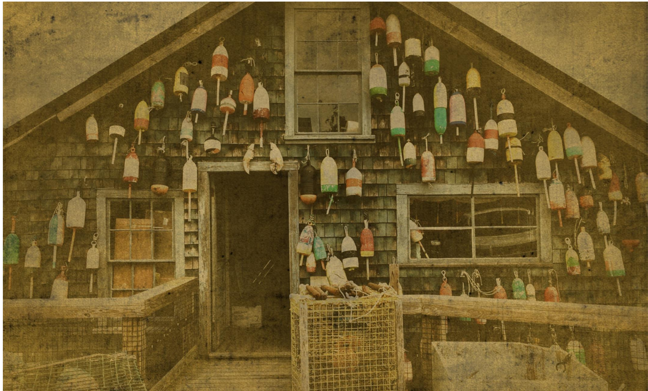
Lobster Shack After VintageScene 892