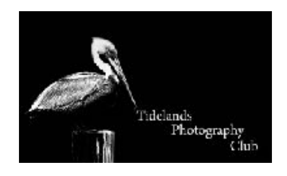
How to transfer huge files

We've all had to send image files to friends or family only to ending up sending multiple emails to stay under the files size limits, or you end up sending reduced size files that don't impress.